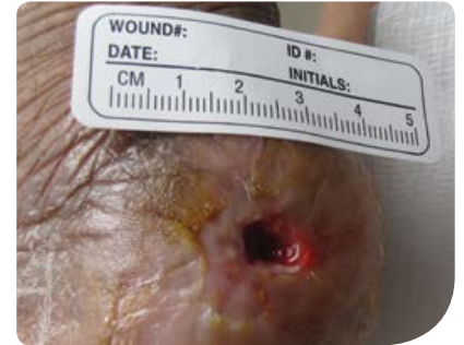
Start of SNAP™ Therapy

Complete epithelialization and closure achieved one week after SNAP™ Therapy discontinued.